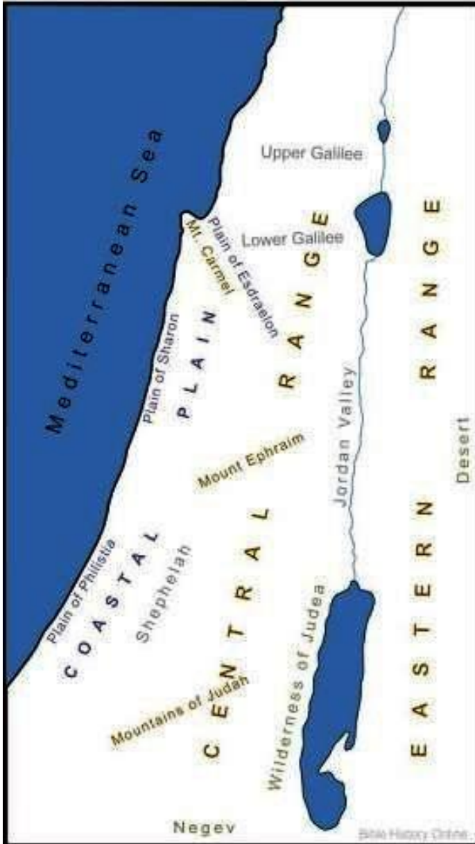
Map of Israel's Natural Divisions